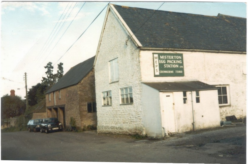
The old Egg Packing Station in Silver Street - pulled down to make the entrance to Packers Way. What everyone knew as the Cart Shed is to the left.