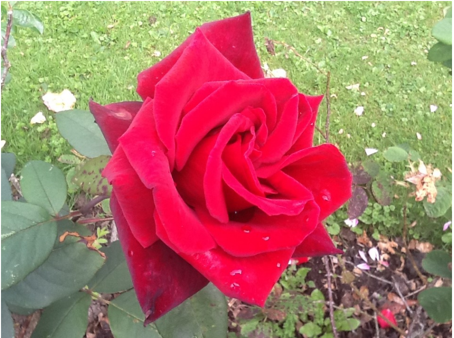
Rose of the month - Deep Secret